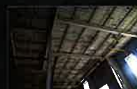
Replace Roof & Paint Structure