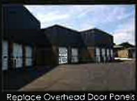
Replace Overhead Door Panels