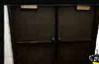
Replace with Fiber Reinforced Polymer Doors