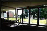
Replace Storefront Framing and Glazing