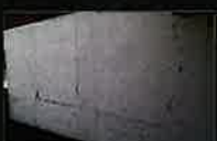
Repair Cracked Wall